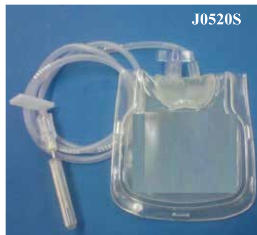
J0520S 50ml sterile blood bag w/ 7.5ml ACD