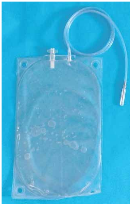
J0520T 1500ml sterile blood bag w/ 225ml ACD, 100cm tubing and 14g needle

In addition, equine plasma can have a life saving role in newborn foals in conditions such as the “failure of passive antibody transfer” and neonatal isoerythrolysis.