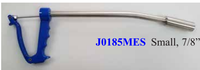
J0185MES Small, 7/8" I.D. $18.00 $27.00