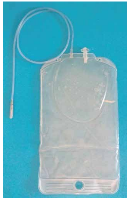
J0520V 3000ml sterile blood bag w/ 450ml ACD, 100cm tubing and 14g needle