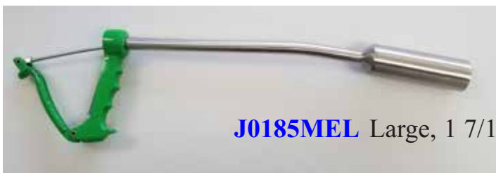
J0185MEL Large, 1 7/16" I.D. $20.00 $30.00

Specially designed balling guns for use with oversized bolus like the Copasure brand of copper bolus.