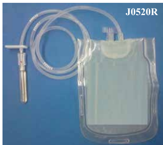
J0520R 100ml sterile blood bag w/15ml ACD

Feline anemia can be an indication for blood transfusions. Feline blood transfusion can be a difficult procedure due to the small patient weight and limited range of transfusion products available for smaller patients. Jorvet is now offering a range of small volume collection bags with anticoagulant already added.